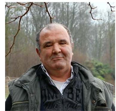
Urban farming in Utrecht