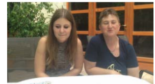
A mother and her daughter talk about the Social Land Program