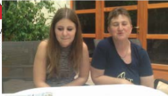
A mother and her daughter talk about the Social Land Program