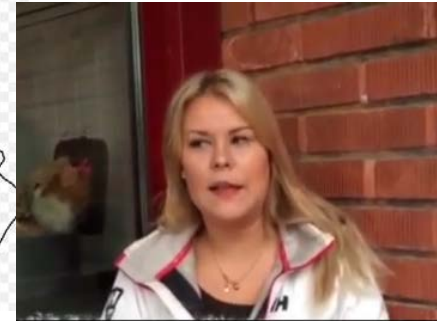
Help from the employment office in the City of Turku